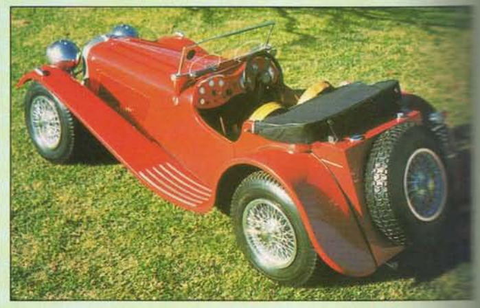
Oz-built half-scale SS 100 can travel at "fast walking pace" with the lever acting as forward/reverse control on the rubber belt and cog gearing. Almost everything has been made from scratch.

two Lucas C40 dynamos sumodified". No plans were a and the only references photographs and wheelbase and wheel diameter figures it just shows what can be done